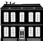
Little Sisters of the Poor

The Sisters collected $6,343.00 from the parishioners of St. Ignatius Parish.