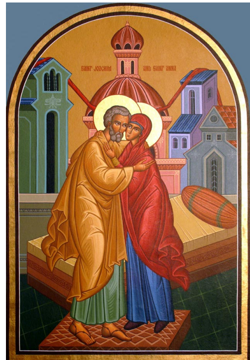
St. Joachim and St. Anne Pray for Us Feast Day: July 26th