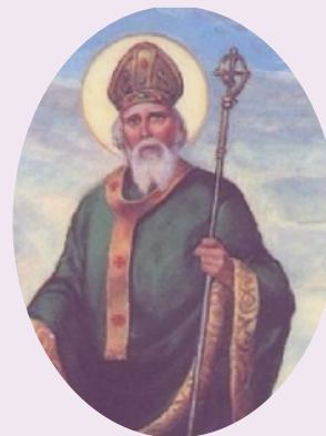
St. Patrick Feast Day March 17th