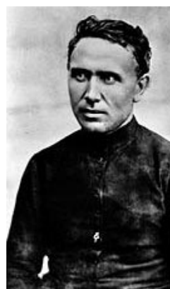
St. Damien of Molokai