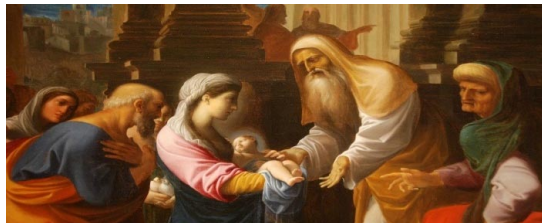
PRESENTATION TO SIMEON IN TEMPLE