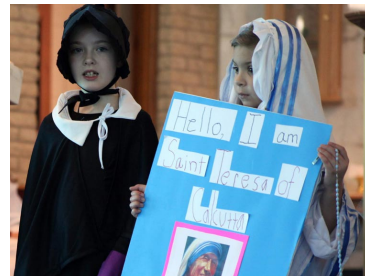
Focused on Faith & Learning