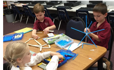
Innovative STREAM Program