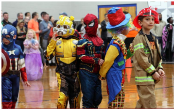
Family Fun Events