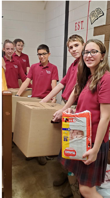
Commitment to Service