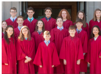
Class of 2019 Awarded $250,00 in Scholarship