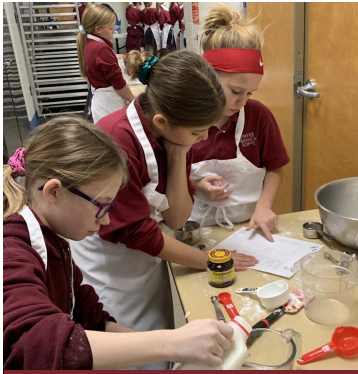
Electives & Student Activities

An Exceptional Catholic Education Awaits.