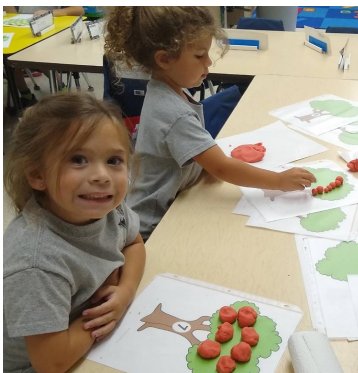
Flexible PreK-3 & PreK-4; Full Day Kindergarten