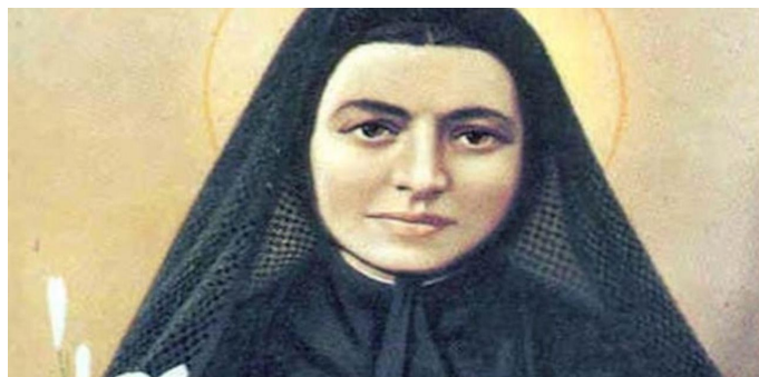
Saint Maria Bertilla Boscardin Feast Day: February 26th

If anyone knew rejection, ridicule and disappointment, it was today's saint. But such trials only brought Maria Bertilla Boscardin closer to God and more determined to serve him.