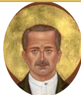
Venerable Matt Talbot Feast Day: June 18th