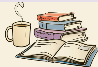
Book 'n Bean